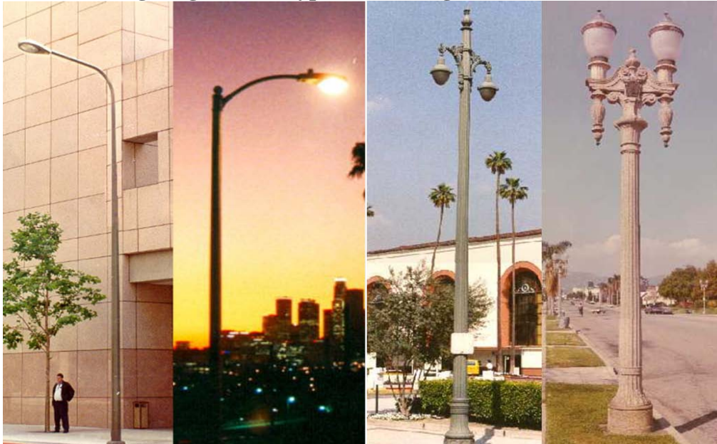
Figure 1: Street Lighting Fixture Types in Los Angeles

Photos 1 & 2 are Cobra-head fixtures; photos 3 & 4 are decorative fixtures that are less suitable for LED retrofits.