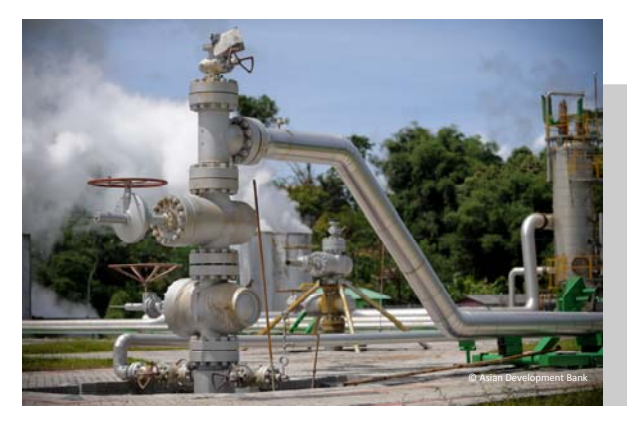
The Energy Sector Management Assistance Program (ESMAP) is a global knowledge and technical assistance program administered by The World Bank. It provides analytical and advisory services to low- and middle-income countries to increase their know-how and institutional capacity to achieve environmentally sustainable energy solutions for poverty reduction and economic growth. ESMAP is funded by Australia, Austria, Denmark, the European Commission, Finland, France, Germany, Iceland, Japan, Lithuania, the Netherlands, Norway, Sweden, Switzerland, and the United Kingdom, as well as The World Bank.

the GGDP. As of March 2017, US$235 million have been raised, to be deployed through a new window within the Clean Technology Fund (CTF) for funding geothermal exploratory investments as part of the Utility Scale Renewable Energy Program. As of March 2017, projects had been approved by the CTF for Chile, Mexico, Colombia, Nicaragua and the Eastern Caribbean, to be implemented by the Inter-American Development Bank; for Turkey, one to be implemented by the European Bank for Reconstruction and Development and another one by the World Bank; for Indonesia, to be implemented by the World Bank; and for Kenya, to be implemented by the African Development Bank.