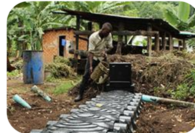
Kenya Promoting Biogas as Sustainable Clean Cooking Fuel for Rural Households (SimGas) 2016-2022