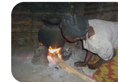
Rwanda Energy Access and Quality Improvement Project (EAQIP) (MINECOFIN) 2022-2026