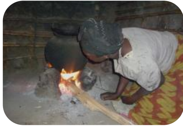
Rwanda Energy Access and Quality Improvement Project (EAQIP) (MINECOFIN) 2022-2026

Carbon finance faces both normal project risk + special risks associated with carbon (i.e. MRV, regulatory)