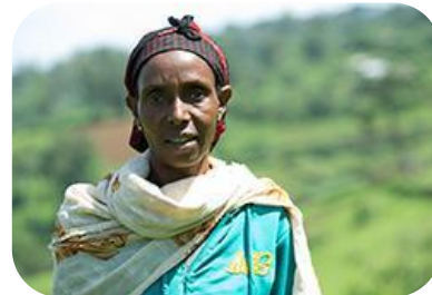
Ethiopia Clean Energy Program (Development Bank of Ethiopia/SNV) 2016-2025