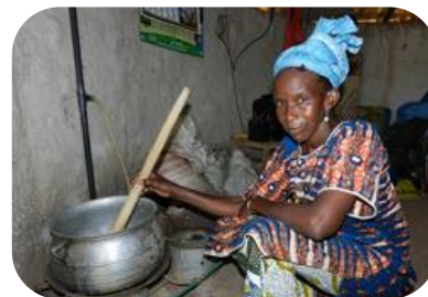
Burkina Faso Support to the National Biogas Program (BNP/SNV) 2017-2025