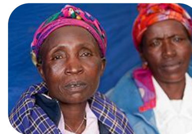
Rwanda Improved Cookstoves Project (Del Agua) 2017-2022