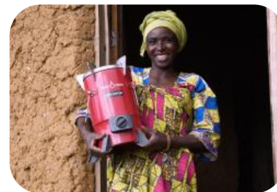
Rwanda Improved Cookstoves Project (Inyenyeri) 2017-2022