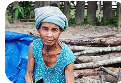
Lao PDR Clean Cook Stove Initiative (MEM/IREP) 2020-2025