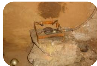
Nepal Biogas Program 2006-2017