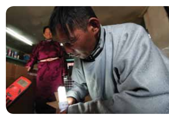
A herder inspecting a solar home system before purchasing at a Sales and Service Center.

Network of Private Sales and Service Centers (SSCs): Prior to REAP, the National 100,000 Solar Ger Electrification Program relied solely on the GoM's network of soum administrators. However, in order to scale-up the program and reach more herders, the REAP was designed to also enlist the support of the private sector. REAP set out to establish a network of Sales and