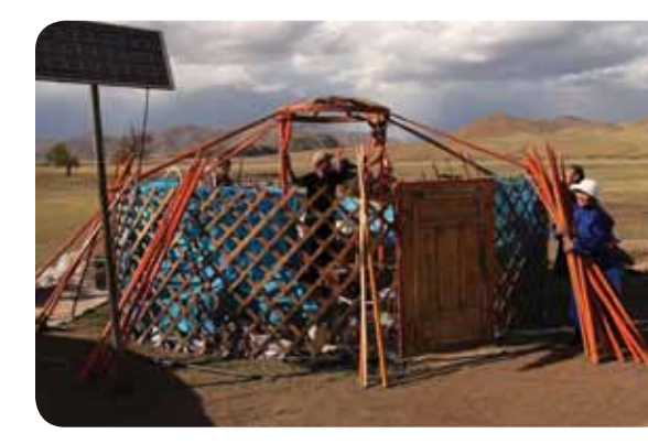
Herders assembling a ger along with solar home system.