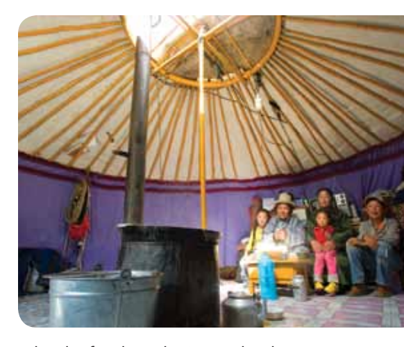
A herder family gathering under the lights in their ger.

cellular phones, amongst other items. It is a market that would not exist in rural Mongolia at the current scale without the availability of electricity for these herders. There is evidence that these consumer electronic products are also improving the business prospects for herders. Radios and televisions, which enable herders to stay connected to the "outside world" is serving as a conduit for information. It has become an important medium for obtaining weather and other market information. Weather reports enable herders to navigate and adapt to harsh and changing weather conditions such as heavy rains, dust storms and extreme winters that may be exacerbated due to impacts of climate change. Such information is critical for better livestock management that lead to enhanced security and improved livelihoods for herders. Even other World Bank projects<sup>15</sup> that are designed to improve rural livelihoods are relying on televisions, for example, to communicate to herders about opportunities for insuring against livestock losses due to inclement weather. There are also increasing instances of cellular telephones being used to arrange business transactions, for example, for the sale of cashmere during the season—an important source of income for many herders. Although a primary objective of the electrification effort was to directly improve the quality of life for herders, the SHSs are also contributing