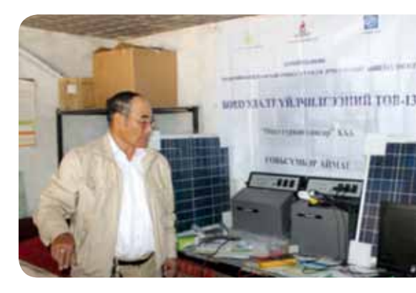
Owner of a private Sales and Service Centers established under REAP showing his equipment.

Service Centers (SSCs) across the country to complement the soum network and expand the reach of the National 100,000 Solar Ger Electrification Program. The SSCs were existing private entities throughout Mongolia that were selected through local advertisements, and then trained and certified by the REAP Project Implementation Unit (PIU). They were local businesses that were mostly engaged in electrical and electronic related services in rural areas in which they operated. Many SSCs