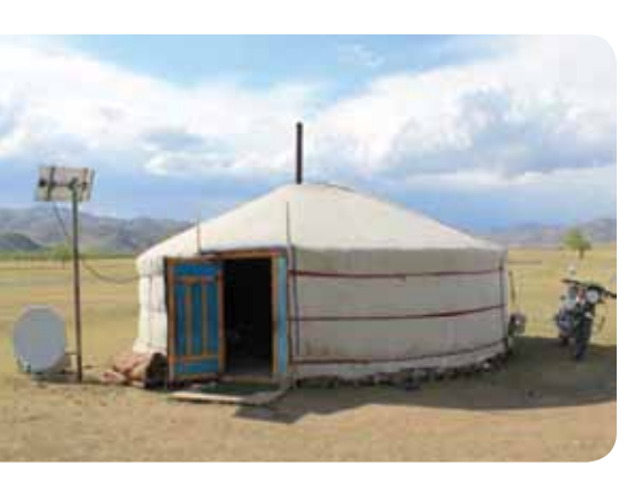
A ger with solar home system and satellite dish.