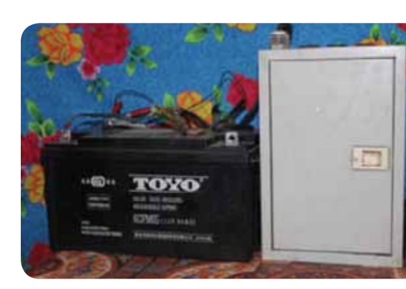
Battery and controller for solar home system.