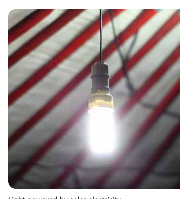
Light powered by solar electricity.

rugged and nomadic way of life. It is said that the Mongolian herder survives in the winter and thrives in the summer. In Mongolia, winters are harsh with temperatures dropping to as low as -30 degrees Celsius, and the cold weather lasts for most of the year. As a result, the land is barren most of the time with scarce vegetation. Therefore, herders have little choice but to roam the vast rural countryside in search of pastures where livestock can graze. Herders frequently relocate with all of their belongings including the portable tents they use for housing, commonly referred to as Gers, as they go in search of pastureland. However, they are in regular contact with the local villages or soums to which they are registered for conveniences including restocking supplies, community activities, administrative matters etc. Given their nomadic lifestyles, herders do not have access to basic infrastructure and other services, including electricity; the herders largely